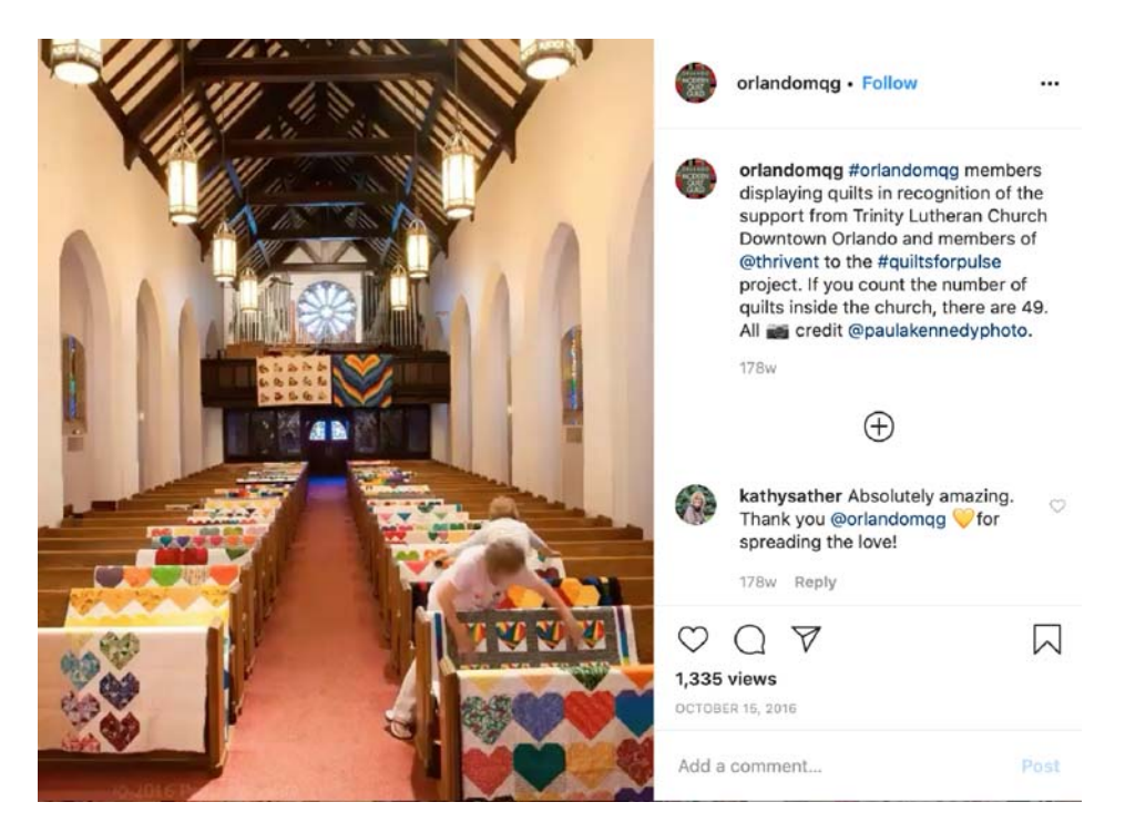
Figure 4. Quilts from the #quiltsforpulse movement displayed in a church.

In the midwestern quilt group, socio-political aspects of the movement were not discussed directly. During the group's first meeting, one member suggested: 'Let's not talk about politics', perhaps as a precaution against conflict as group members shared opposing political perspectives in a landscape of political division in the United States at the time of the observations. Yet, the participation in #quiltsforpulse through the production of heart quilts created a unique opportunity for socio-political engagement in which people of divergent political perspectives could productively