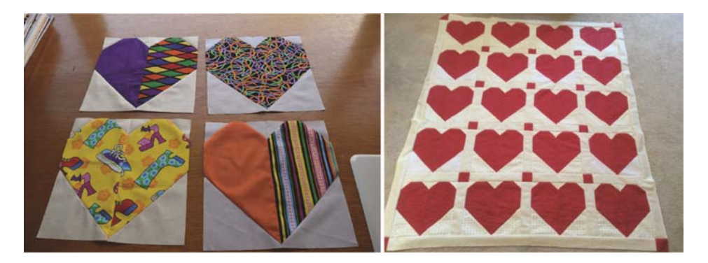
Figure 6. Pieces of a heart quilt laid out, ready to be sewn together (left) and a completed quilt (right).

contributions to the #quiltsforpulse movement. The compassion and care the midwestern quilt group members had for each other translated into the quilts and through the quilts to the strangers who received them. #quiltsforpulse opportunities for crafting friendship, thus, fostered care and compassion locally and across the collective socio-political activist movement.