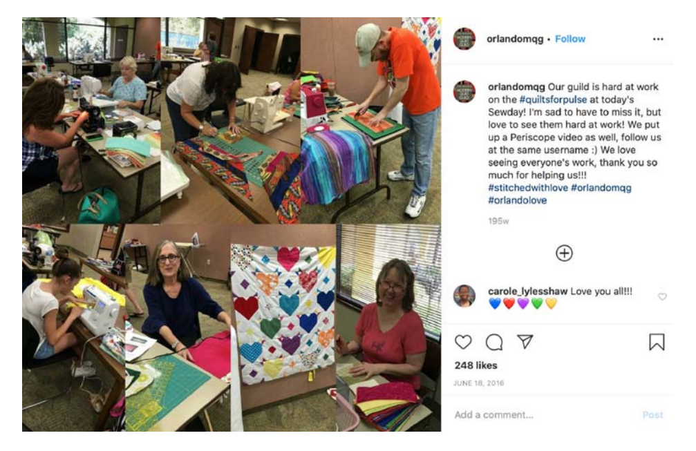
Figure 1. An OMQG Instagram post showing eight female and one male guild member working on quilts.

#quiltsforpulse mostly consisted of women, who organized, crafted, and distributed quilts. Figure 1 presents an example excerpt that shows a collage of six photographs with what appears to be eight different women and one man working on quilts. The collage is captioned with a message that connects the predominantly female production with collective socio-political activism by referencing the movement's hashtag, #quiltsforpulse, which directly connects the craft to the LGBTQ+