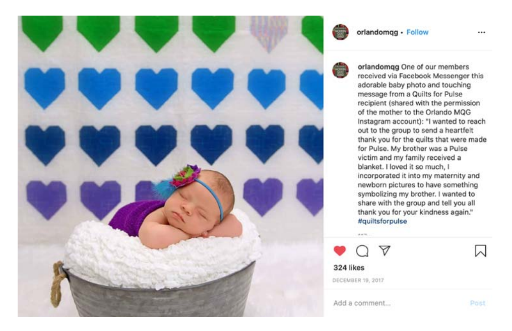
Figure 3. An image of a new family member in front of a donated quilt.

Similar to the instance of the quilt displayed in the OPD's headquarters, the baby quilt stands in place of many other quilts that were received but not shared online. In contrast to the OPD quilt, the baby quilt connected the movement to people's private lives and helped foster domestic intergenerational connections. It was another way for quilters and people who followed the movement to see the impact of the carefully crafted material responses to the tragedy.